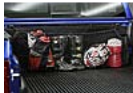
Cargo Net Exterior $49.00 Installed MSRP*