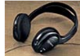
Wireless Headphones $82.00 Installed MSRP*