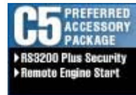
C5 Preferred Accessory Package ▶ RS3200 Plus Security ▶ Remote Engine Start $828.00 Installed MSRP*