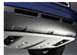
Front Skid Plate $425.00 Installed MSRP*