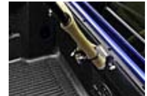
Locking Bike Fork Attachment $95.00 Installed MSRP*