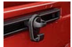
Mini Tie Down w/Hook (set of two) $45.00 Installed MSRP*